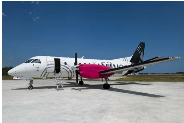
(All of Silver Airways' flights are operated with its fleet of 22 highly reliable and fuel-efficient 34-seat Saab 340B Plus turbo-prop aircraft.)

Members of United's MileagePlus® and JetBlue's TrueBlue customer loyalty programs can also earn frequent flyer awards for travel throughout Silver's Florida network.